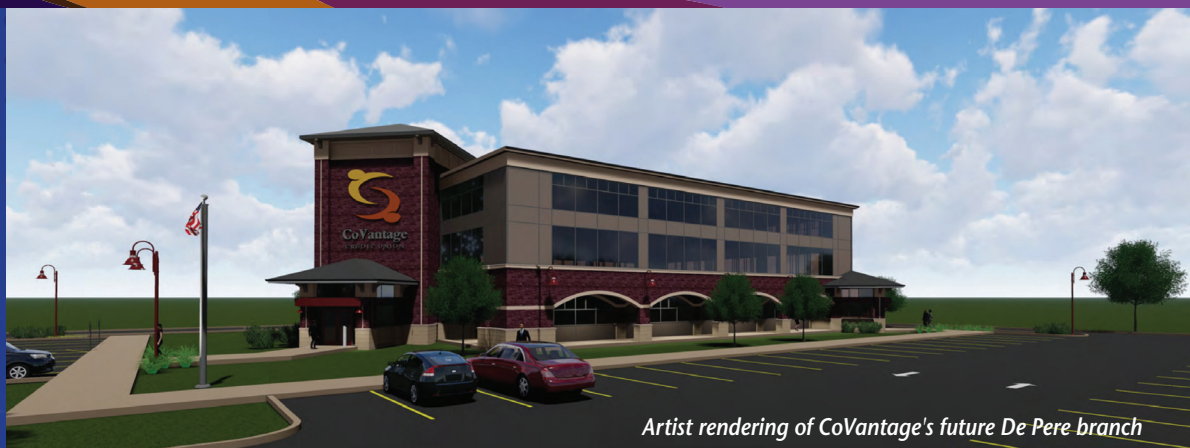
Artist rendering of CoVantage's future De Pere branch