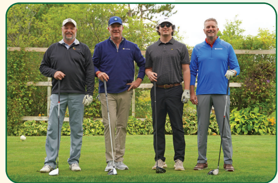
2023 Team TruStage

Donate an item which can be used as a prize for our hole raffles or in our auction. We could really use items such as gift cards (restaurants, wineries, movies), vacation rentals, sporting event tickets and more — if you've got it to donate, we'll take it! Donors are listed on auction signage.